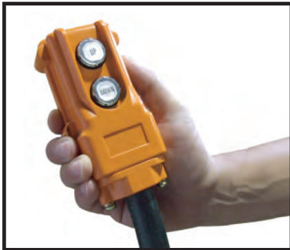
Hand Held UP/DOWN Remote Pendant Control

The cadaver tray is easily transferred from ambulances, refrigerators, etc. to the cart by raising/lowering roller bed platform (locking handles ensure tray is secure while in transit). Adjustable limits are used to set specific UP/DOWN positions as determined by operator.