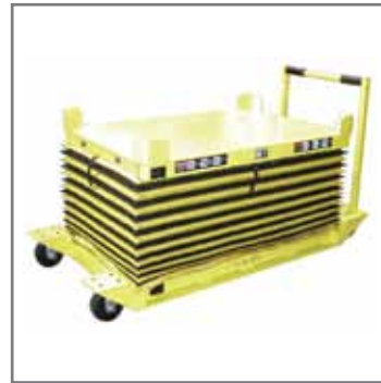
Portable Lift Table

Supplies loads continuously to an assembly station with one, two or four position configurations. Capacity up to 8,000 lbs [3629kg].