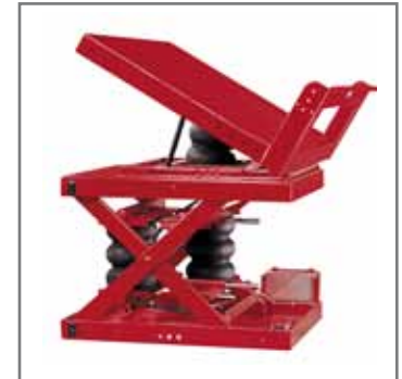
Lift and Tilt

By tilting container forward, the table positions dunnage for easy loading or unloading. Lifting capacity up to 8,000 lbs [3629kg].