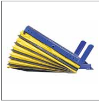
Slide and Tilt

Maintains clearance on the operators and unload side of the table. Lifting capacity up to 8,000 lbs [3629kg].