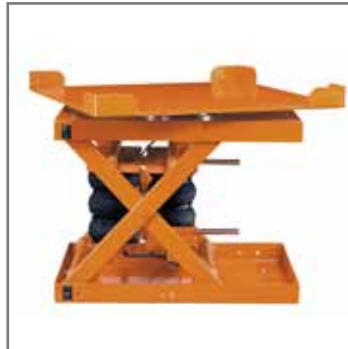
Lift and Rotate

Rotate table raises loads to the proper ergonomic height and provides up to 360° of rotation. Lifting capacity up to 8,000 lbs [3629kg].