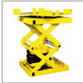
Double Scissor Lift

When extra lift is needed to raise loads to a higher and safe ergonomic height. Capacity up to 2,000 lbs [904kg].