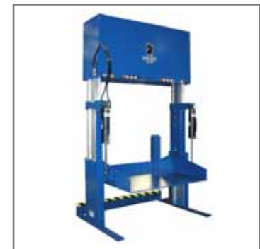
Zero Lift Loaders

Combines the convenience of ground level loading with the footprint of a standard lift table. Capacity up to 4,000 lbs [1814kg].