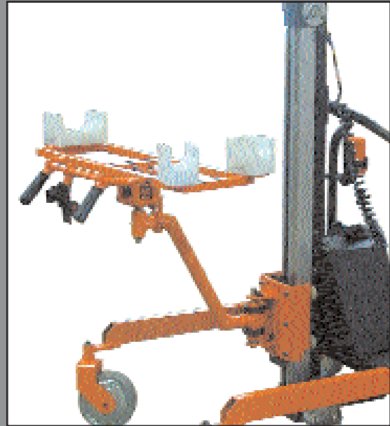
End effector for positioning an exhaust system onto a vehicle.