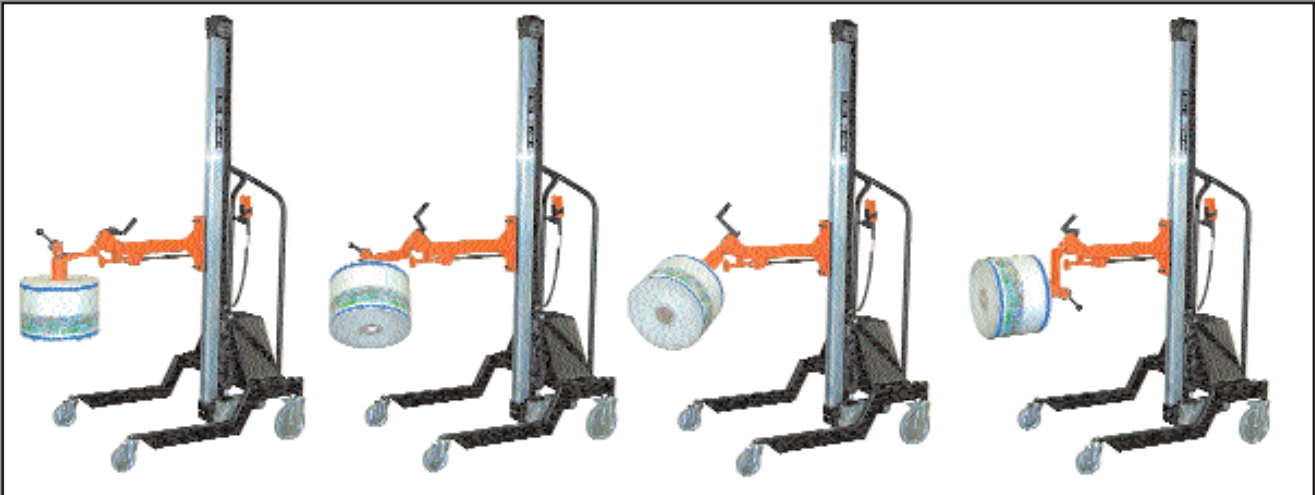
Roll Handler with manually operated rotate and push off device.