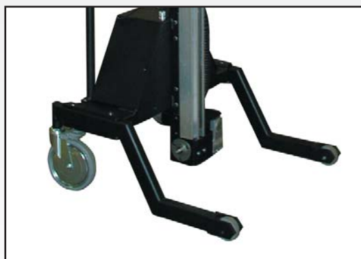
Low Profile Legs