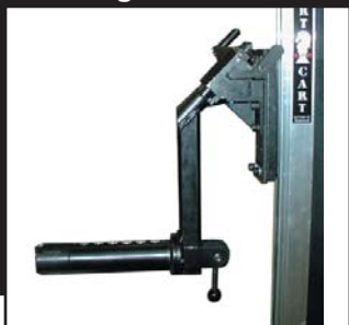
Detail of the roll handling end effector.