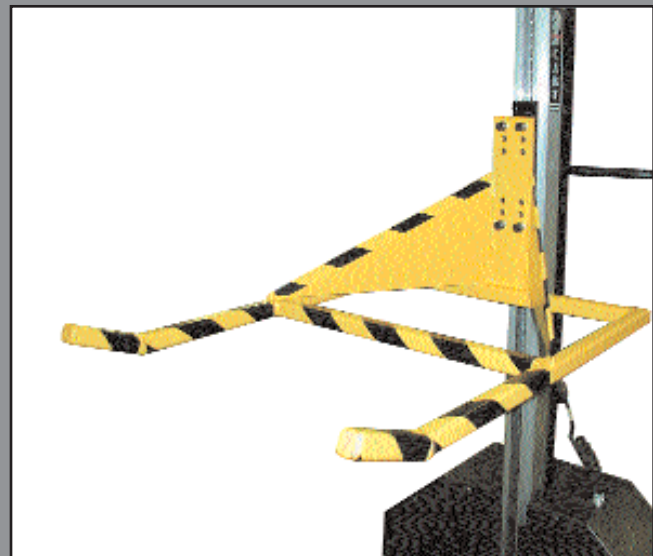
Fork end effector.