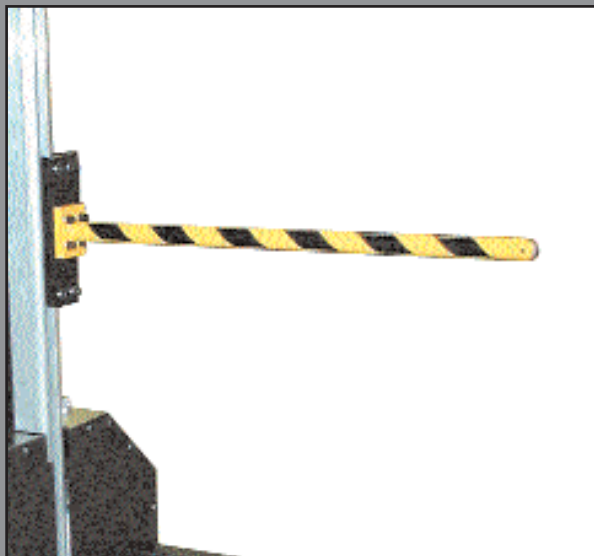
Probe with roller bearing end.