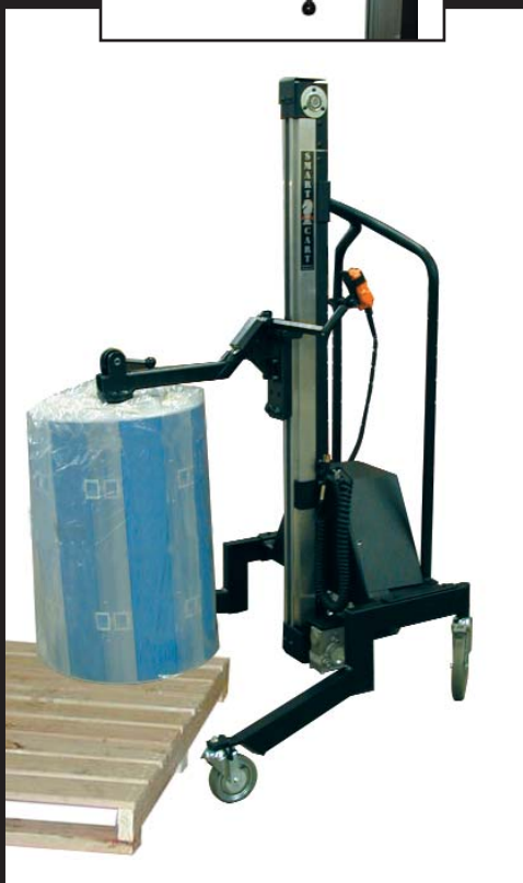
Roll handler with manual rotate and custom angled legs for unloading pallets.

A new addition to the Knight Industries product line, the Smart Cart is designed to be customized to handle a wide variety of material handling needs.